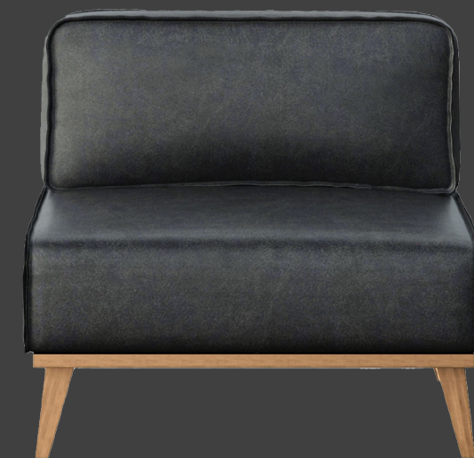
BLACK INK ARMCHAIR