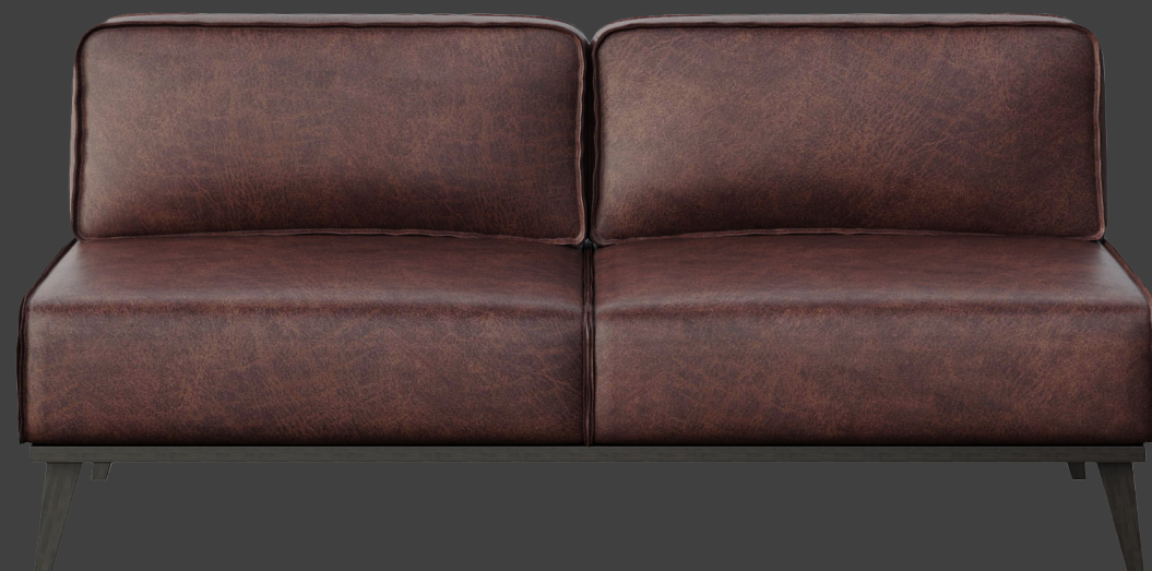
DARK BROWN 2-SEATER SOFA