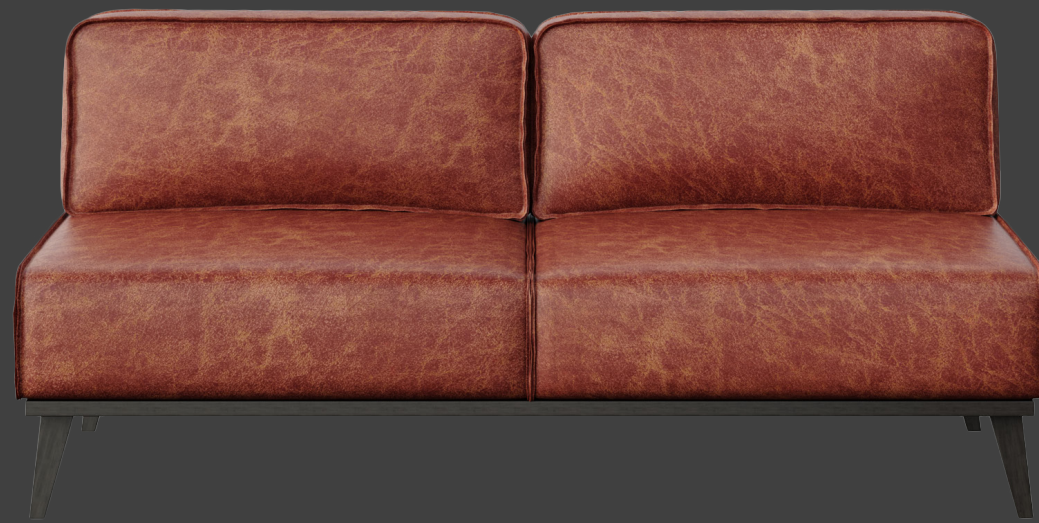
COGNAC 2-SEATER SOFA