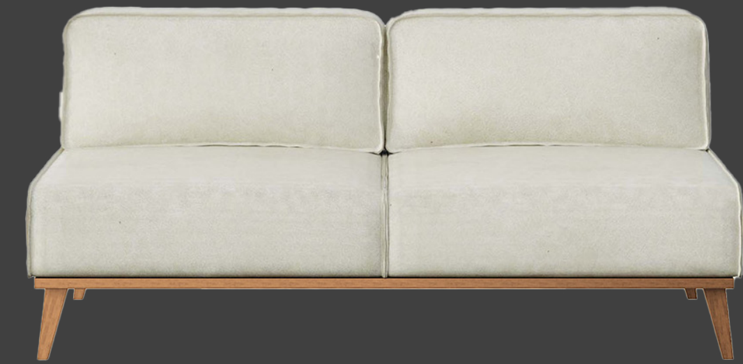
BEIGE 2-SEATER SOFA