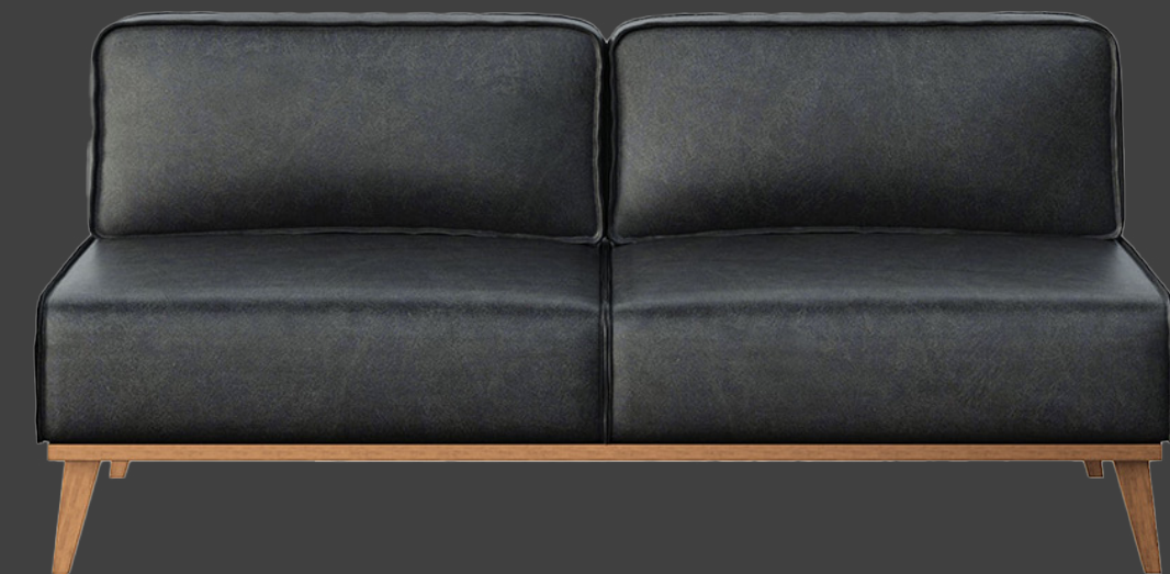
BLACK INK 2-SEATER SOFA