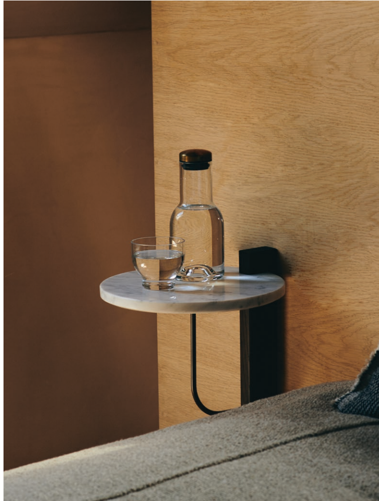
CORBEL SHELF Designed by Krøyer-Sætter-Lassen