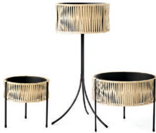
Umanoff Planter, 27, Black / Rattan, by Arthur Umanoff Umanoff Planter, 69, Black / Rattan, by Arthur Umanoff Umanoff Planter, 32,5, Black / Rattan, by Arthur Umanoff

Offered in three different sizes, the Umanoff Planter marries sleek powder coated steel lines with curved handwoven rattan for a natural contrast. Designed in 1961 by the late Arthur Umanoff, a master of mid-century modern, the elevated planter is suitable for both indoor and outdoor use.