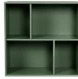
Forest green - 031