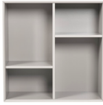
Fog grey - 009