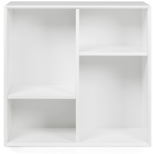
White - 005