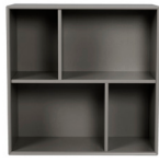
Grey - 014